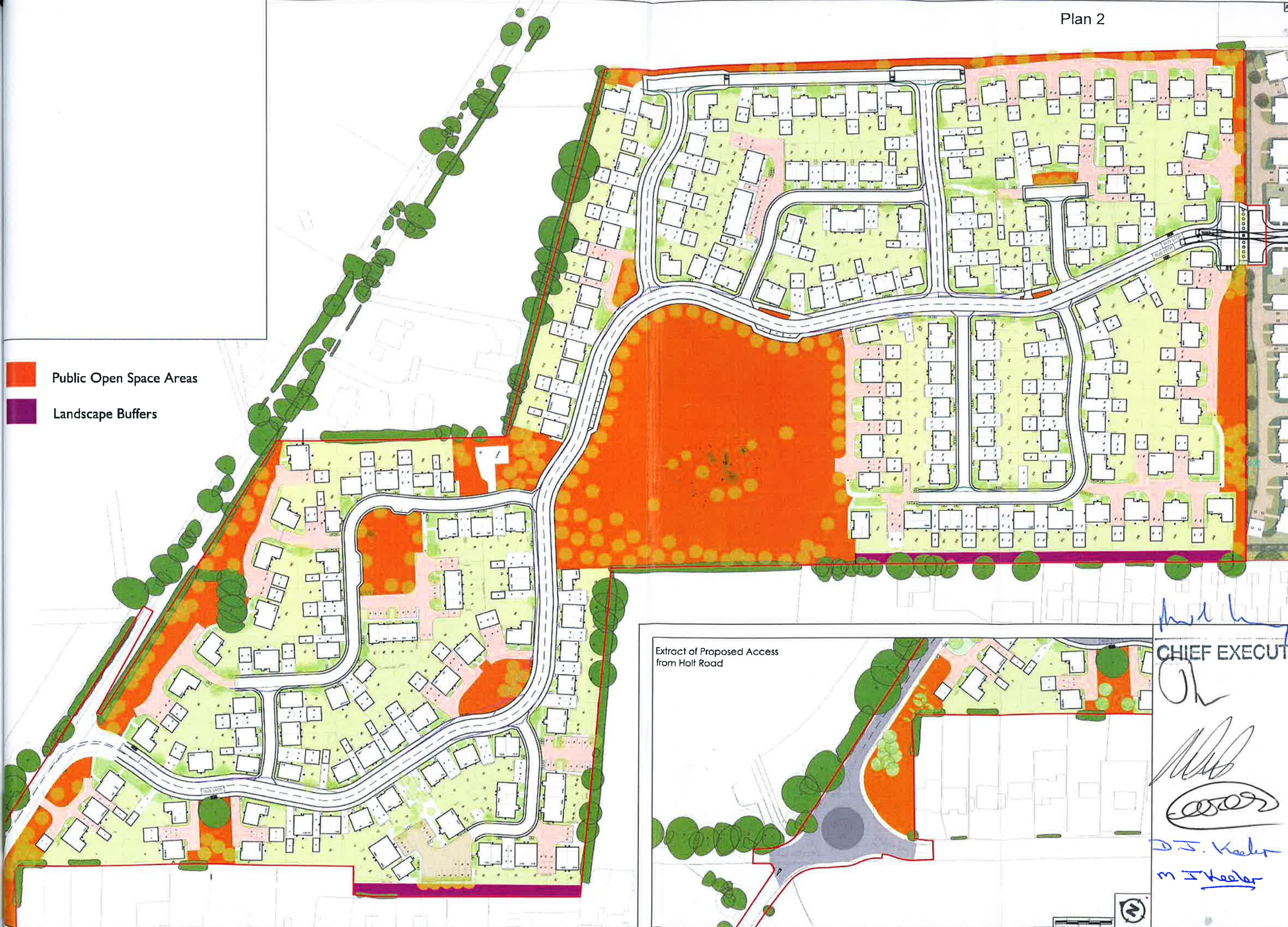
Extract of Proposed Access from Holt Road