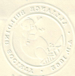
Chief Executive and Clerk