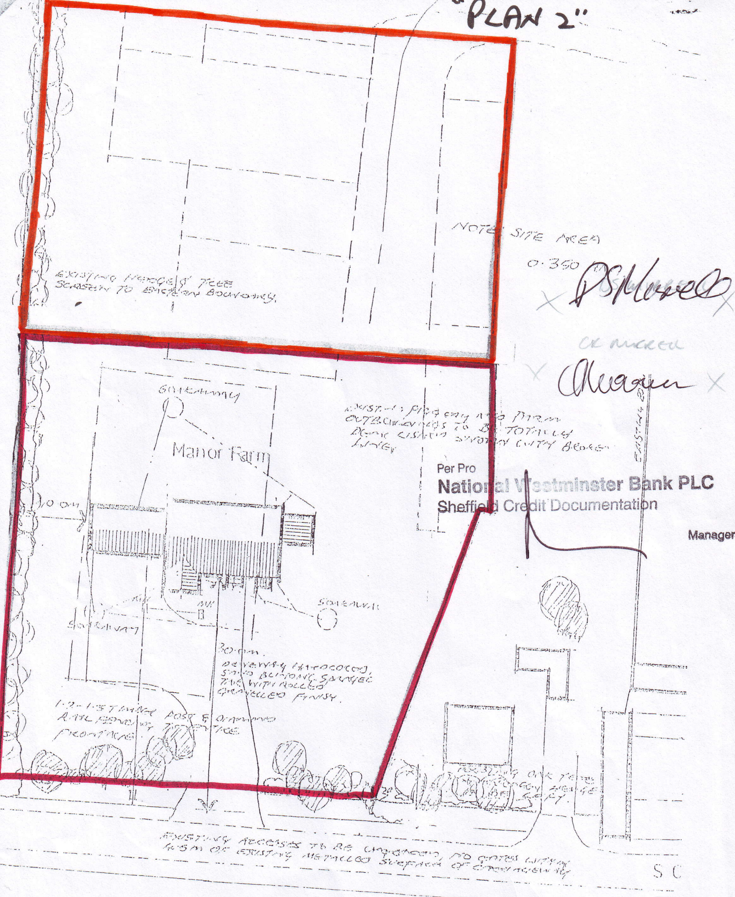
Block layout plan 1:500