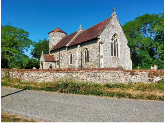
St Mary's Church

Howe Conservation Area is one of the smaller conservation areas in South Norfolk and was designated in 1975. Howe's character is that of a hamlet with its western half set around a large historic green with groups of trees and ponds, all set in open arable landscape. The eastern half of the conservation is more enclosed and centred around the church.