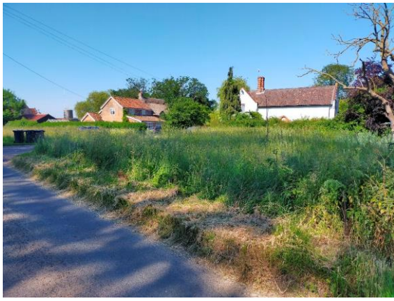
House north of Howe Hall