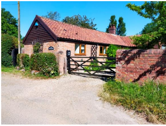
The Old Byre