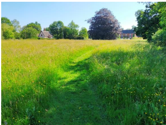
Looking east from The Green

On approaching the settlement from the north-east side, trees begin to enclose the road going westward from Howe Lane giving no hint of the church until the street opens out to the north side where the church and its boundary wall dominate views. This enclosed space around the church contrasts with the larger open views of the main green.