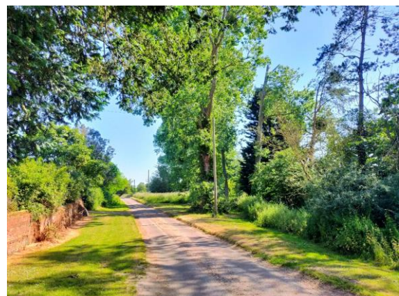
View towards The Green from Howe Hall