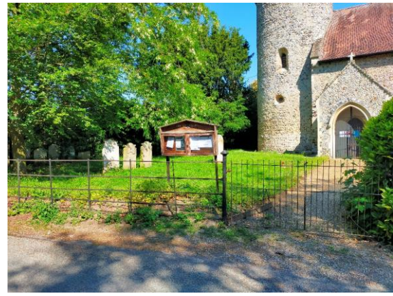
Iron railings and gate at church