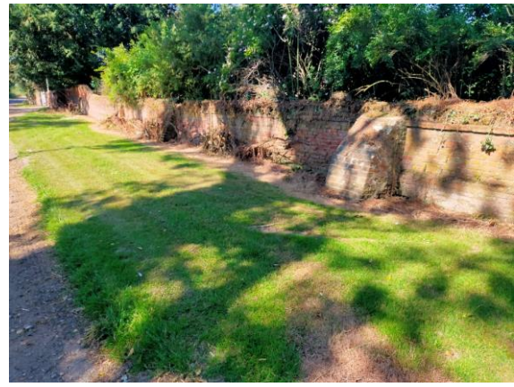
Front wall of Howe Hall