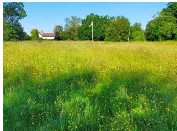
Looking west from The Green