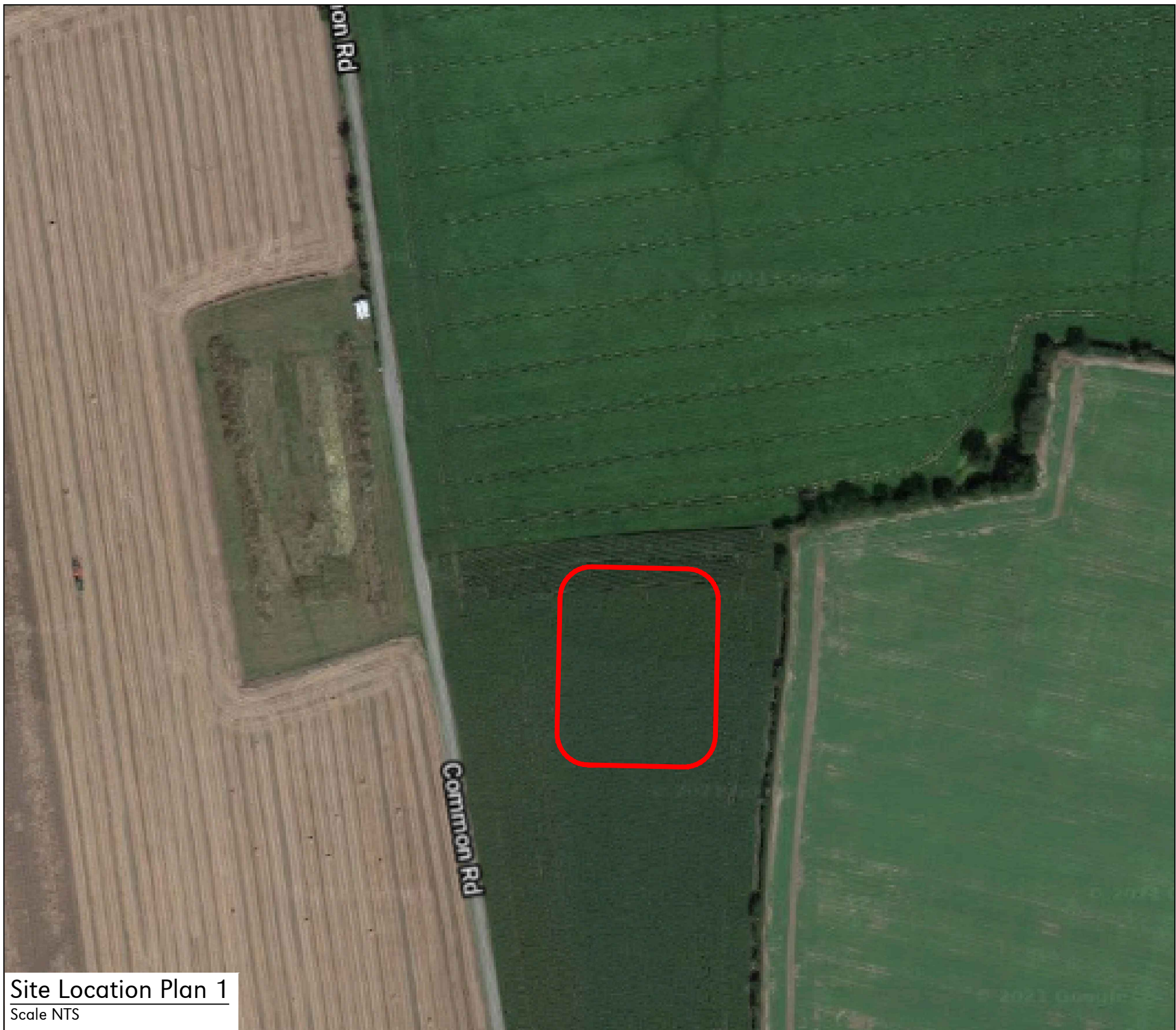
Site Location Plan 1 Scale NTS