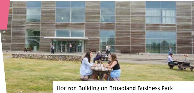
Horizon Building on Broadland Business Park

For two thirds of our residents, the new office is the same, if not closer than our old office and we also have an outreach office in Diss. The Octagon, in the Mere's mouth, is a gateway to our services where residents can speak to a member of staff who will help resolve their queries online, put residents in touch with relevant services via the telephone or book a face to face meeting.