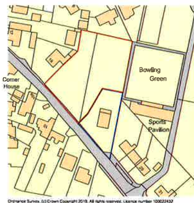
Location Plan scale 1:1250