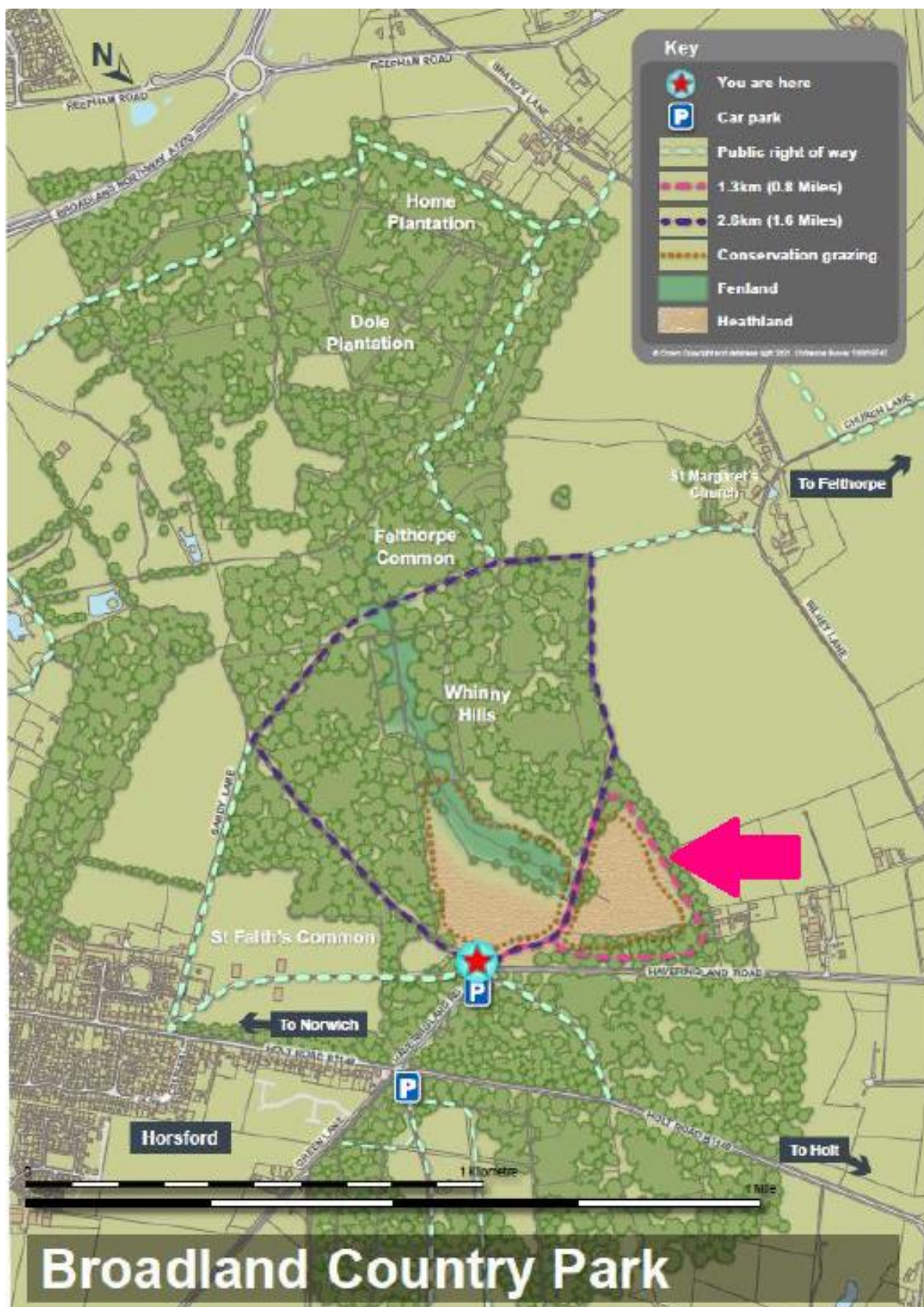
Location of works on 'Pink Route'