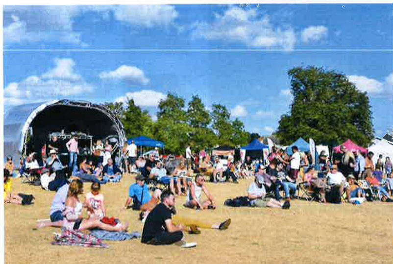
Gig in the Park in Diss Park last year.

"The last meeting was a challenge, and I remember that as I left the meeting one attendee said to me, "I can't believe how badly you and Gig in the Park have been treated. And I did not feel able to contradict him".