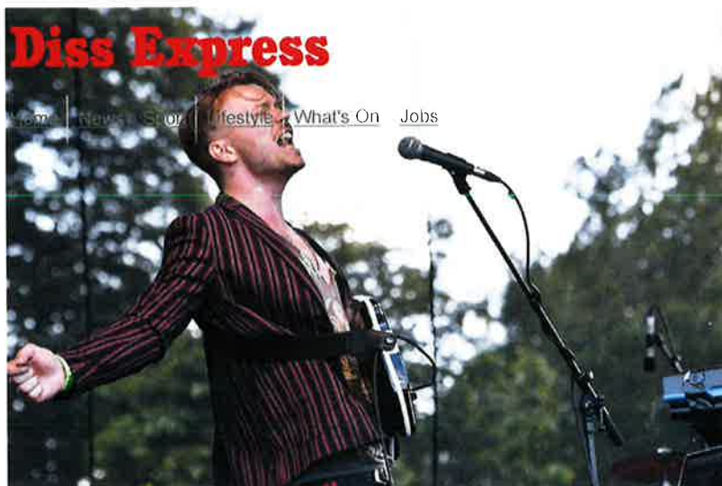
Purple Lights performing on the main stage in 2018

"Many were supportive but at the same time extremely conservative, and would just not provide us with the comfort we require to ensure that investment today will contribute to returns in 2020.