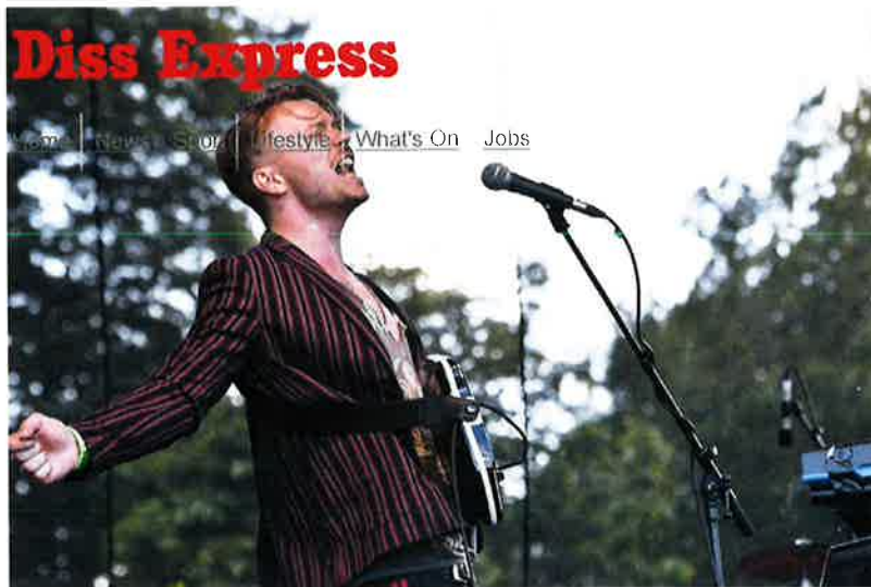
Purple Lights performing on the main stage in 2018

"Many were supportive but at the same time extremely conservative, and would just not provide us with the comfort we require to ensure that investment today will contribute to returns in 2020.