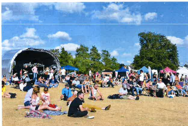
Gig in the Park in Diss Park last year.

"The last meeting was a challenge, and I remember that as I left the meeting one attendee said to me, "I can't believe how badly you and Gig in the Park have been treated. And I did not feel able to contradict him".