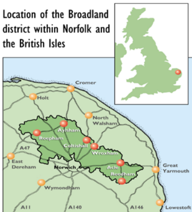
Location of the Broadland district within Norfolk and the British Isles