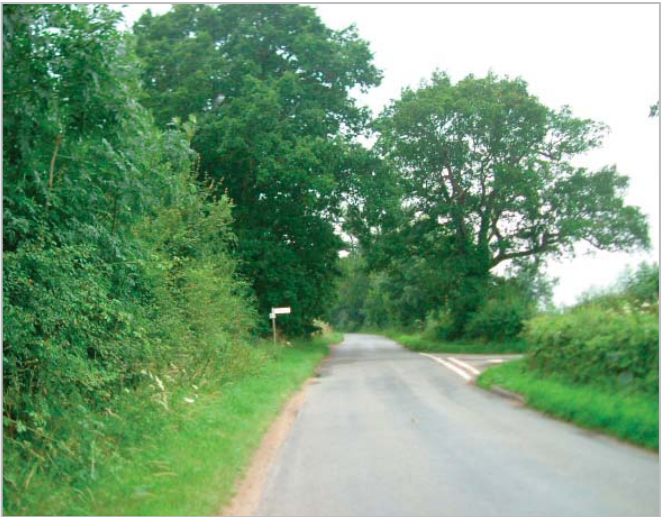
Hedgerows provide enclosure along roadsides