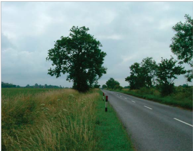
Wide grass verges and former hedgerow trees