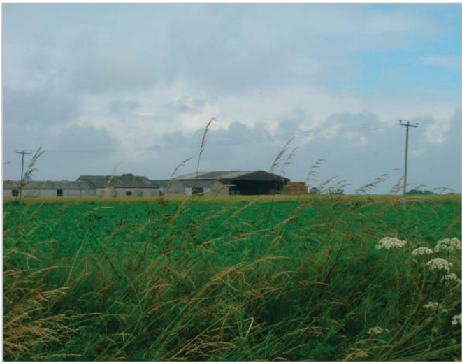
Large farm buildings