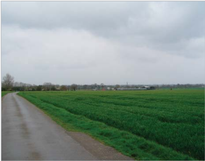
Flat open plateua with roadside lined by ditches