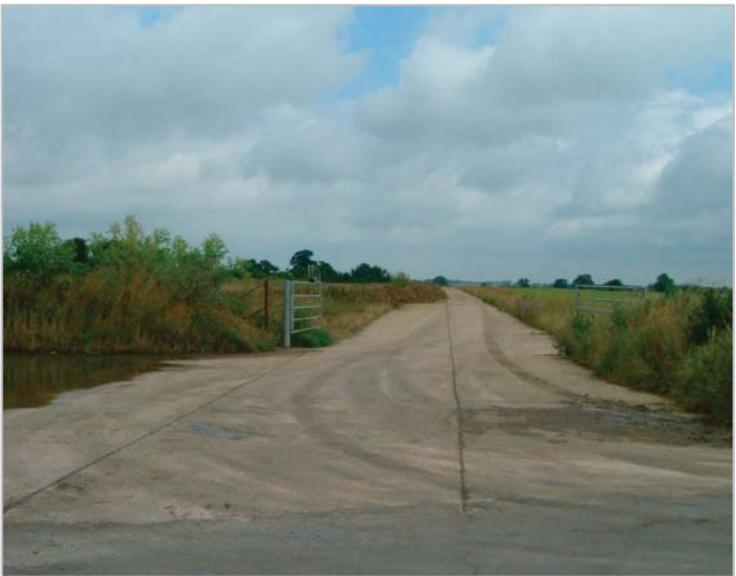
Airfield west of Sneath Common