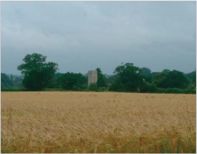
View to isolated church at Coston