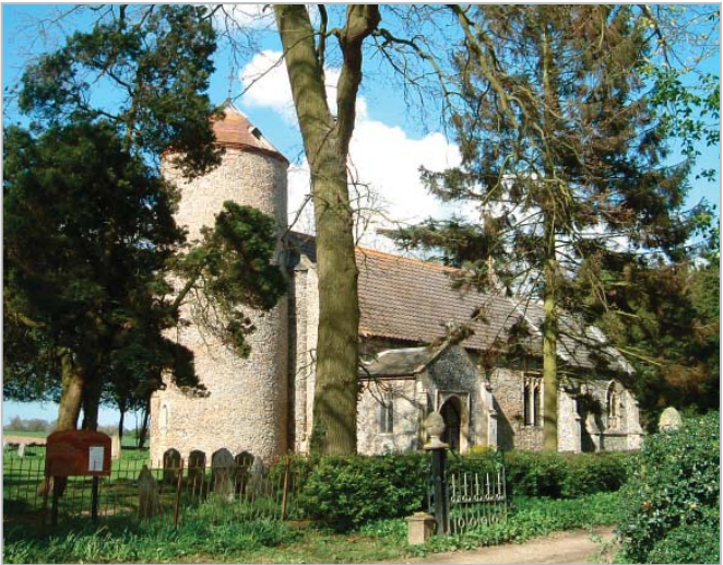
Round tower church at Wellborne