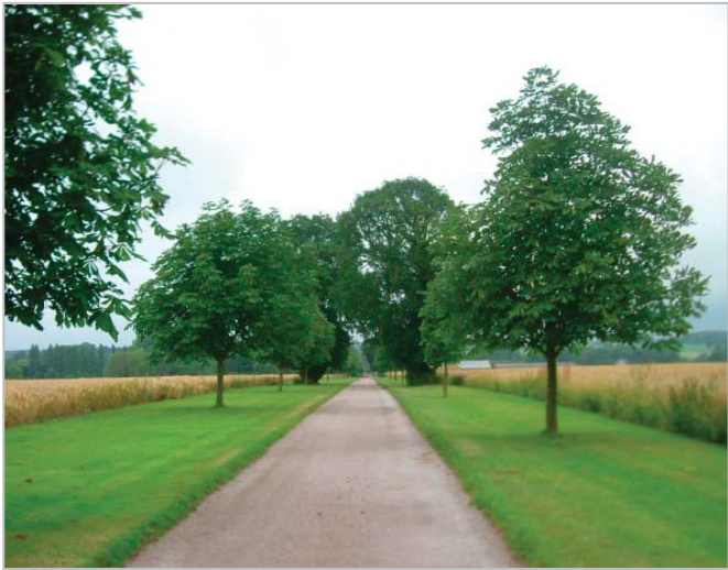
Parkland approach to Hall Farm near Coston