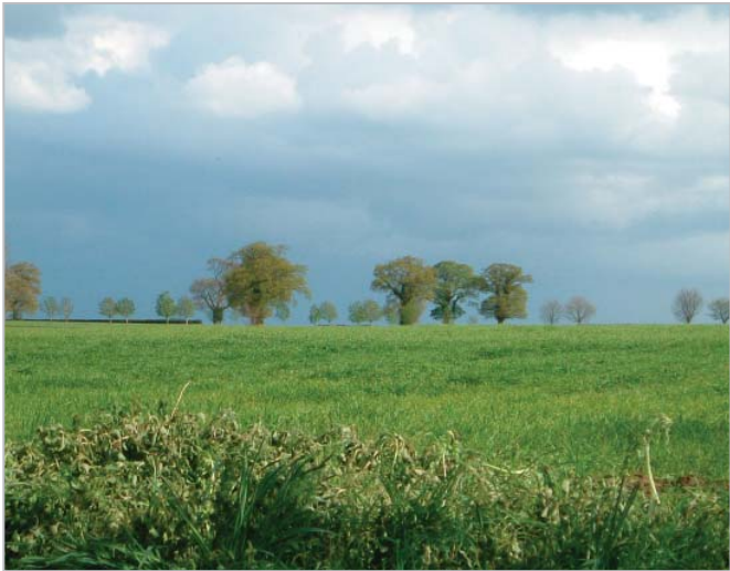
Arable fields and hedgerow trees