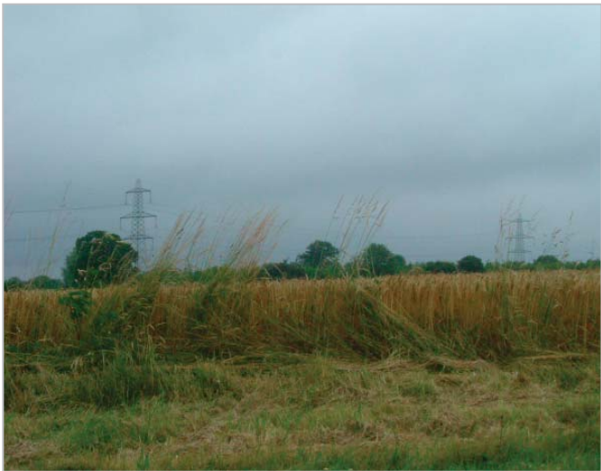
Pylons are prominent on the higher ground