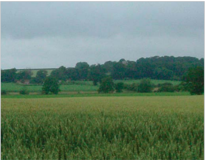
View across the Yare/ Tiffany Rural River Valley to Brandon Parva church