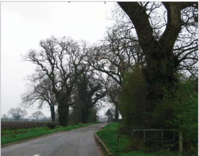
Large oaks are distinctive as hedgerow trees