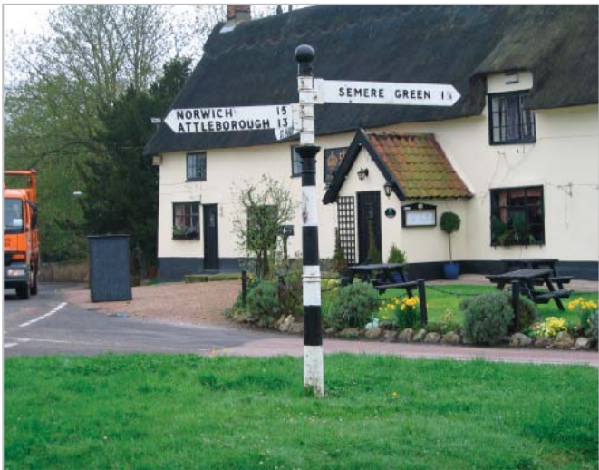
Characteristic black and white signposts