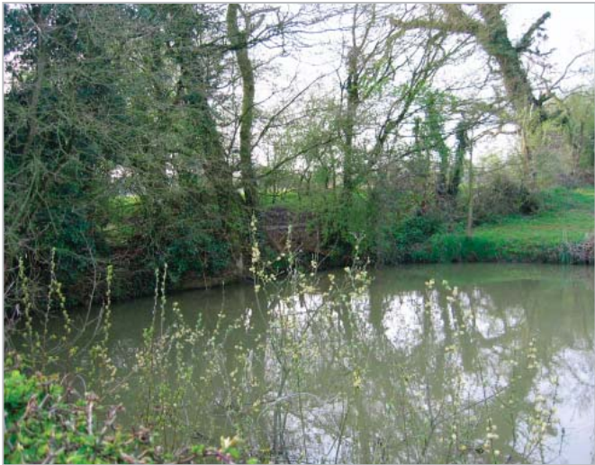
Ponds and moats are a feature