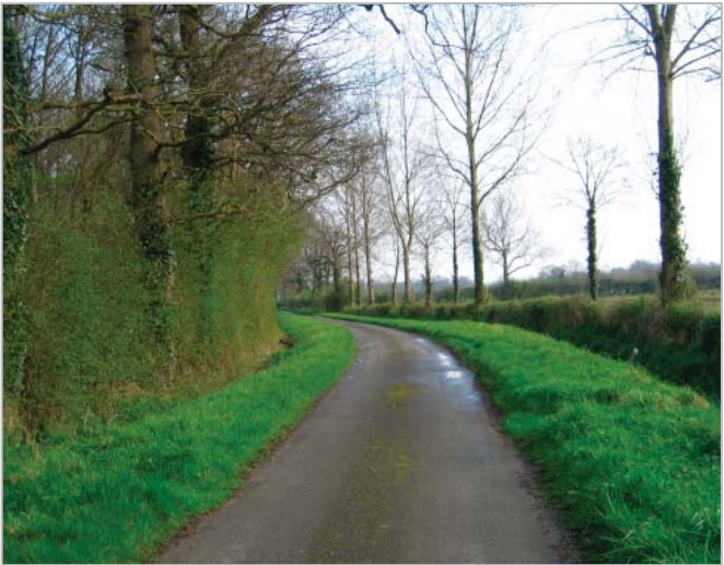
Ditches and wide grass verges occur alongside roads