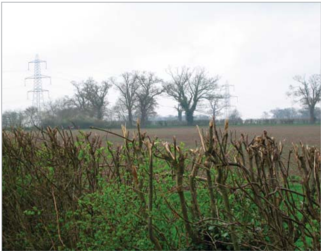
Pylons cut through the area