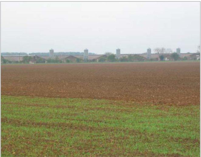
View across arable fields towards farm buildings