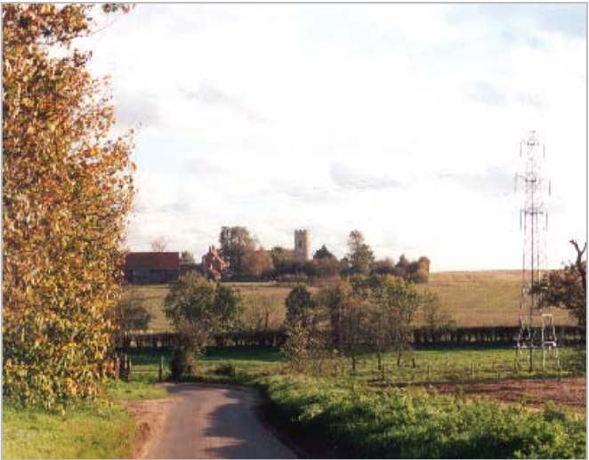
Characteristic 'isolated' round-towered flint church at Helington with pylons dominant in the foreground