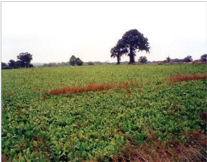
Large scale arable landscape near Surlingham with sparsely distributed mature hedgerow trees