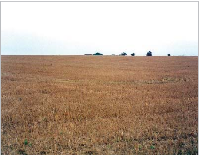
Exposed, open character where field boundaries have been lost