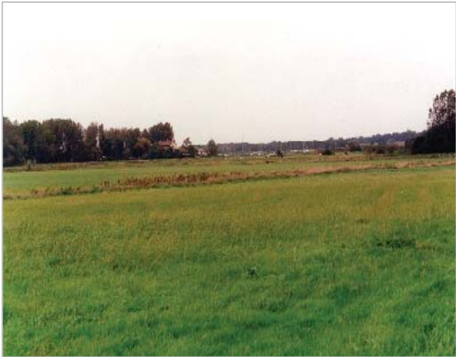
View from Langley Green at the edge of the character area towards The Broads