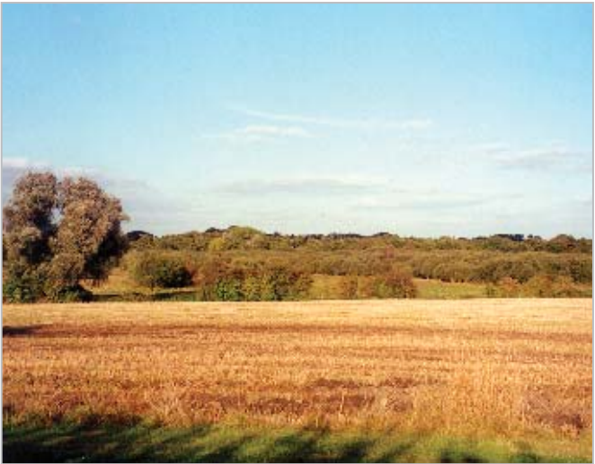
The tributary valleys, including this area near Moneyhill Farm, have created areas of undulating landform with more intimate wooded areas