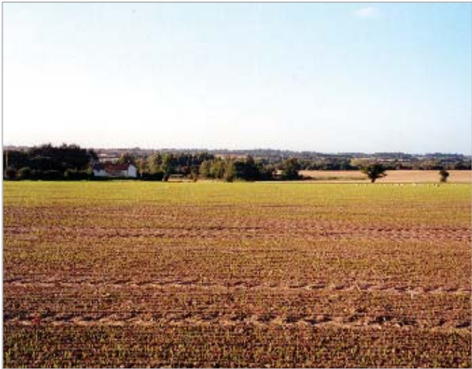
The landscape is sparsely settled comprising isolated farm buildings set within the farmland between the villages