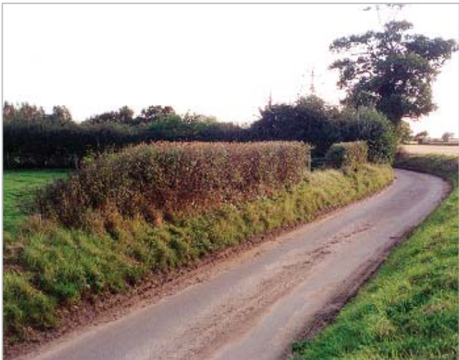
The area has a distinctive intricate network of rural lanes but roadside and field hedgerows are frequently denuded or gappy, as this scene near Hingham illustrates