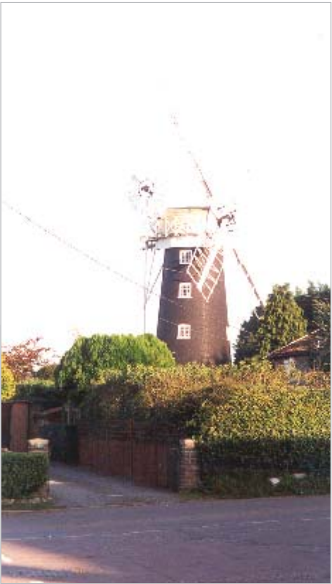
Wicklewood Windmill is a distinctive local landmark that contributes to local landscape character