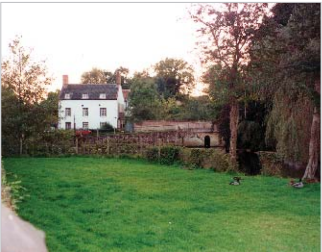
Small vernacular settlements are found clustered around old bridging points for example at Wramplingham