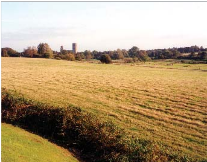
View of Wymondham Abbey across the Tiffey Valley