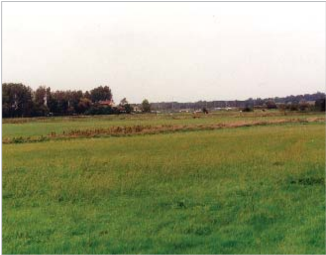
Typical paddocks and rough-grazing set against the well-vegetated bankside of the River Tiffey on the outskirts of Wymondham