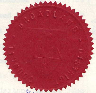
Assistant Chief Executive and Solicitor to the Council

THE COMMON SEAL of BROADLAND ) DISTRICT COUNCIL was hereunto ) affixed in the presence of:- )