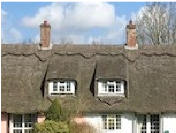
Thatch and eyebrow dormers

Plain tiles and slate can be found in Station Road, with fine brick detailing and shaped barge boards. Timber windows, with metal casements and leadwork survive but many unlisted buildings now have modern versions in UPVC.