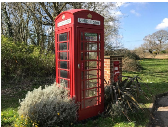
K6 telephone box

The road signs at the junction are prominent.