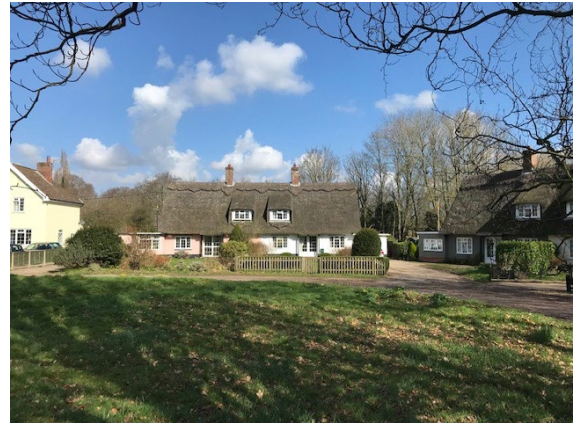
Nos 1 & 2

Across the main road the first pair of cottages (No.7, The Green), on the Green are of the same style, but with a thatched roof. They have the same, highly decorative quality in design and materials with the Wodehouse crest on the chimney. The cottage, now one dwelling, is separated from the Green by a low metal railing. The modern rear extension is not seen from the Green but works well. New hedging would improve the hard line of the boundary fence to the B1108.