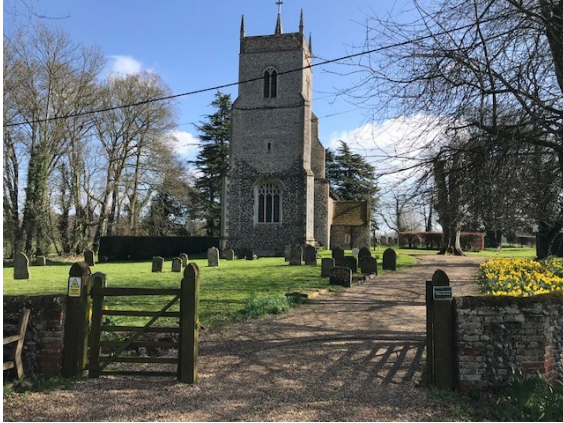
Church of St Peter set amongst trees

The conservation area is in two parts : one an attractive village green designed as part of the renewed landscape of Kimberley Hall, the other developed to support the expansion of the railway network. The varied style of the dwellings are set within a wider rural setting.