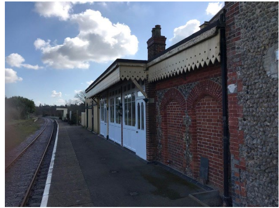
The Railway Station

In most cases, the front of these houses has been developed affecting the setting of the houses, even where they are partly hidden by hedges or fences. The various outbuildings and extensive parking areas, are often over dominant.