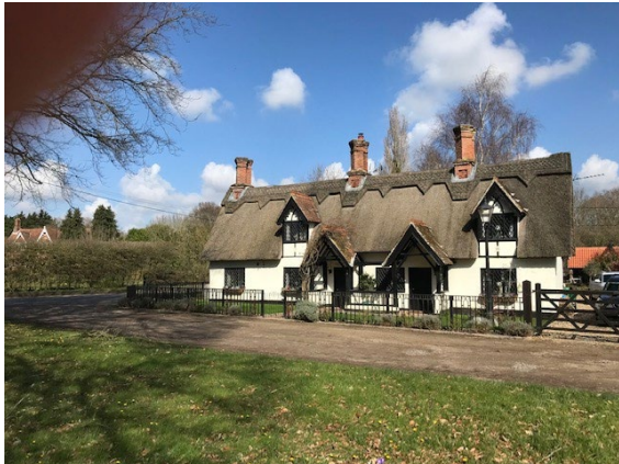
No 7 and The Green

At the northern end, Green Farmhouse and the various outbuildings to the west, form a significant group, although their wider impact is limited, being set well back from the road, and screened by the tall road side hedges. The house is a good example of mid-Victorian Tudor revival style, with patterned brickwork, tiles and decorative bargeboards. The red brick and pantiled outbuildings have been converted to a separate dwelling.