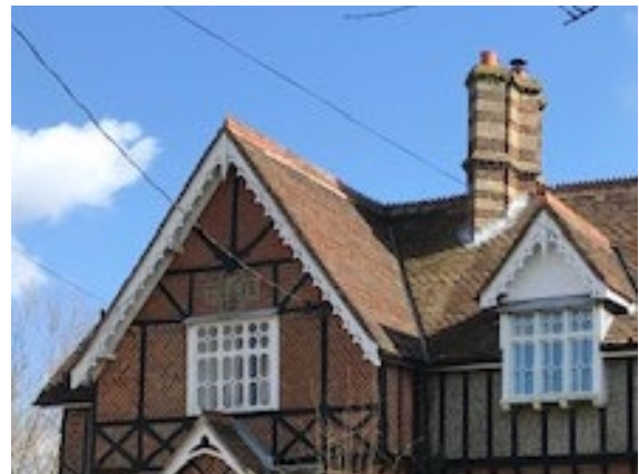
'Mock timber' and decorative bargeboards