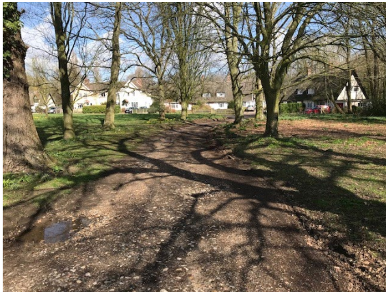
Extensive tree coverage on the green

Trees and hedges make a significant contribution to the natural character of the conservation area and its setting.