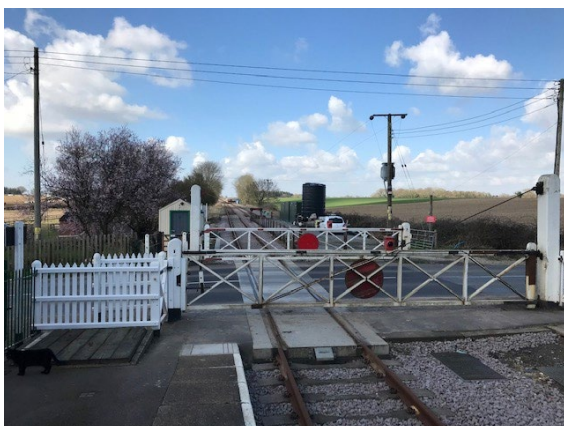
Railway crossing gates

Around the Green are short paling fences or railings to the cottages with flint and brick walls to the churchyard.