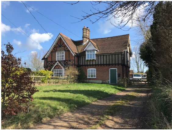
Tudor Revival – 5 & 6