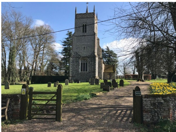
St Peters Church