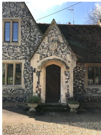
The School Lodge

The school lodge marks the entrance to Kimberley Park. The choice of cut ashlar and knapped flint makes it comparable only with the church in its construction materials. A wall in the same materials links with the churchyard wall to the north.