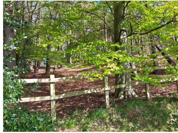
Woodland north of Sunnyside

The conservation area is primarily rural in nature comprising the lush watermeadows of the valley floor, the wooded plantations, the grassy banks, hedgerows and isolated trees.