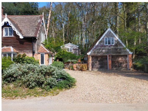
Garage Building at Water Meadows

The Watermeadows dates from the mid-18 th century and has a plain tile roof with gable dormers. The decorative bargeboards are not original but add to its character. It has been much extended and altered but all in a sympathetic manner, including the garage and outbuildings