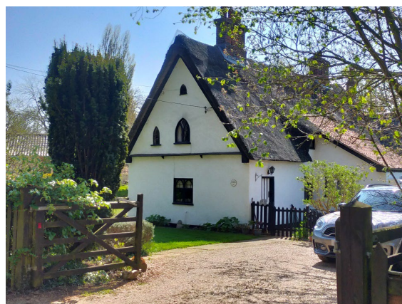
Entrance to May Cottage (No.54)