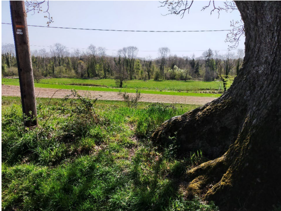
River meadows viewed from the significant tree along Sunnyside

The River Chet and its valley is a significant feature of the parish, the river itself flowing towards Loddon, before its confluence with the River Yare near Reedham. It is in this area that the conservation area is located.