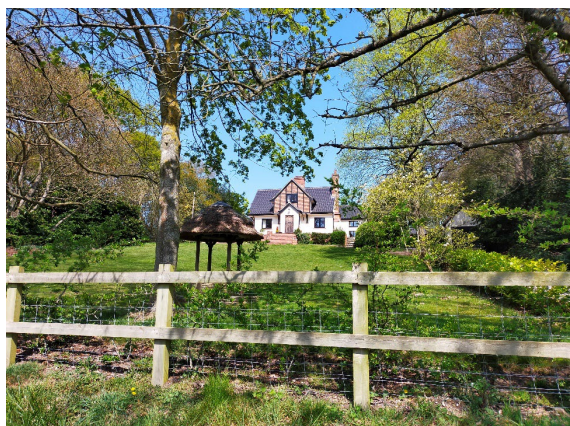
Cherry Tree Cottage