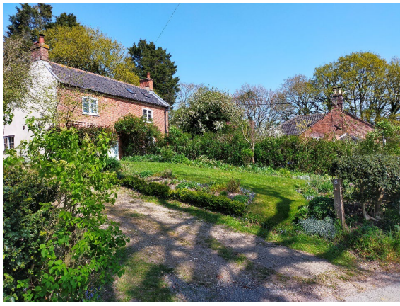
Victorian estate cottages, Sunnyside