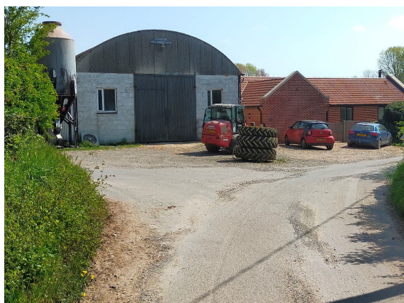
New bungalow at the junction of Bussey Bridge and Bungay Lane

There are the only two listed buildings in the conservation area. These date from around the early 19 th century; the first is to the east, a thatched "Gothic" cottage comprising 54 & 55 Bussey Bridge Road (May Cottage & Bluebell Cottage) and the other to the west, a superb example of a "Cottage Orneé," Lodge Cottage.