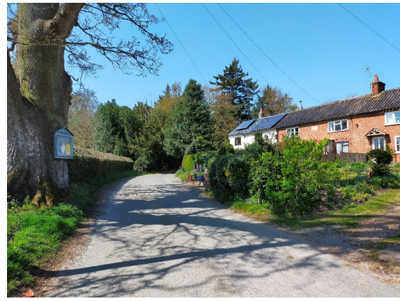
Victorian estate cottages with significant tree to the left side

Where Sunnyside turns northward up the hill, there is a range of Victorian cottages, presumed built for estate workers. There is a stone date plaque 1889 on the western range marking when it was purchased by William Ford Thursby, a parish rector, for occupation by the village poor. There are modern extensions to the rear and most have unsympathetic modern windows and doors.