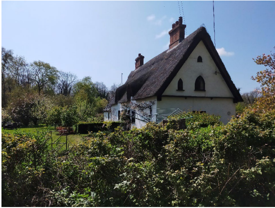
54 & 55 Bussey Bridge Road

Bergh Apton lies five and a half miles to the south west of Norwich and to the south of the A146 Norwich to Lowestoft road. It is one of a series of parishes located within the triangle of land formed by the A146 and the A140 (Norwich to Ipswich) roads as they radiate out from the city centre. This matrix of parishes is based primarily on agriculture with village, hamlet and farmsteads dotted around the gently rolling countryside