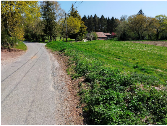
Looking East towards the stables from Sunnyside