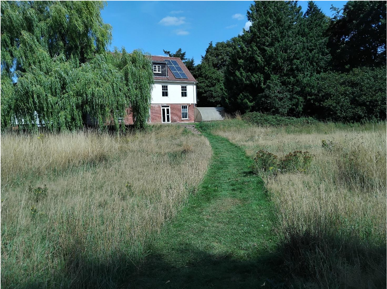
Figure B. Carrowbreck House Grassland

Remove Grass Clippings – After all but one of the cuts advised above, grass clippings should be removed and not left to rot down in situ. This can be achieved by using a ‘cut and collect’ mower or by raking off arisings to dispose of offsite or in a designated compost heap on the Site. The removal of cuttings is crucial for removing nutrients from the soil and reducing the dominance of grasses.