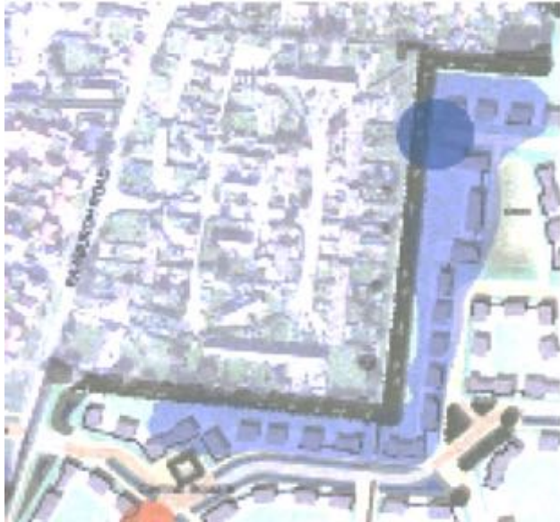
Map 6: Extract from Design & Access Statement Document (Page 61): Parker's Close.

Below is an artist's impression of how a 'buffer' could look.