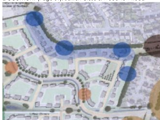
Map 5: Extract from Design & Access Statement Document (Page 61): Buxton Close & Woodview Road

Adjoining Residential Boundaries: the principle of boundary treatments and a 'buffer' zone (screening using trees, shrubs and hedges) has already been established. In principle, it has been agreed with the Development Consortium and Local Planning Authority. A 'buffer'