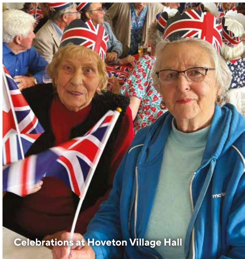
Celebrations at Hoveton Village Hall

Events included traditional afternoon teas, parades, historical workshops, 1940s-themed music and dancing, and poignant remembrance services. These gatherings not only paid tribute to those who served but also brought neighbours together to reflect on the enduring importance of peace and community.