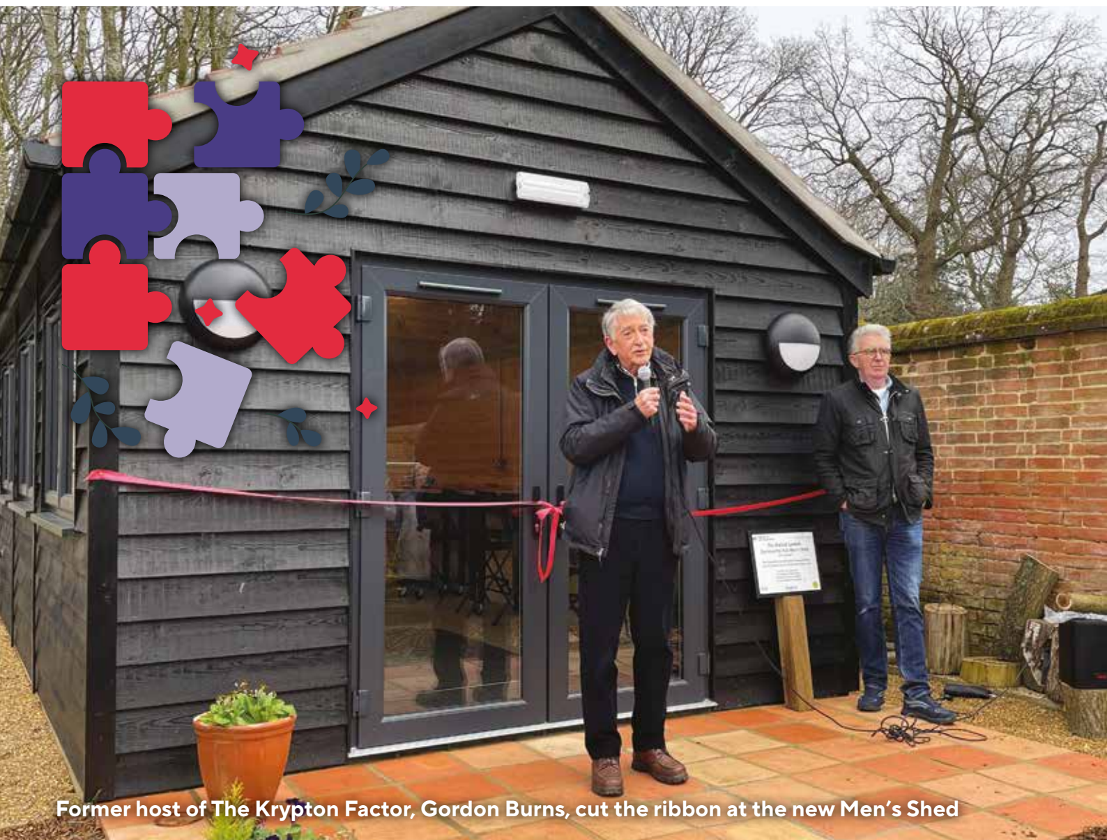
Former host of The Krypton Factor, Gordon Burns, cut the ribbon at the new Men's Shed

In Great Plumstead, we awarded The Walled Garden and Café £24,500 for a new Men's Shed. Over 100 community events have already been planned, which will bring people together and combat social isolation, including a regular whittling group, bushcraft events, photography sessions and a cycle maintenance group.