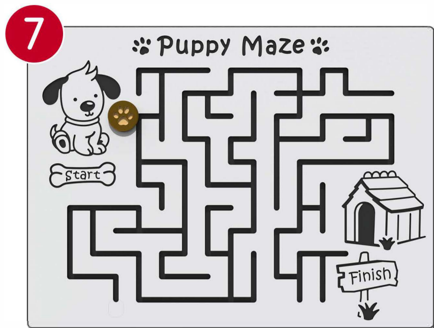
Puppy Maze Panel

COGNITIVE Joy of learning, curiosity, understanding & knowledge of the world.