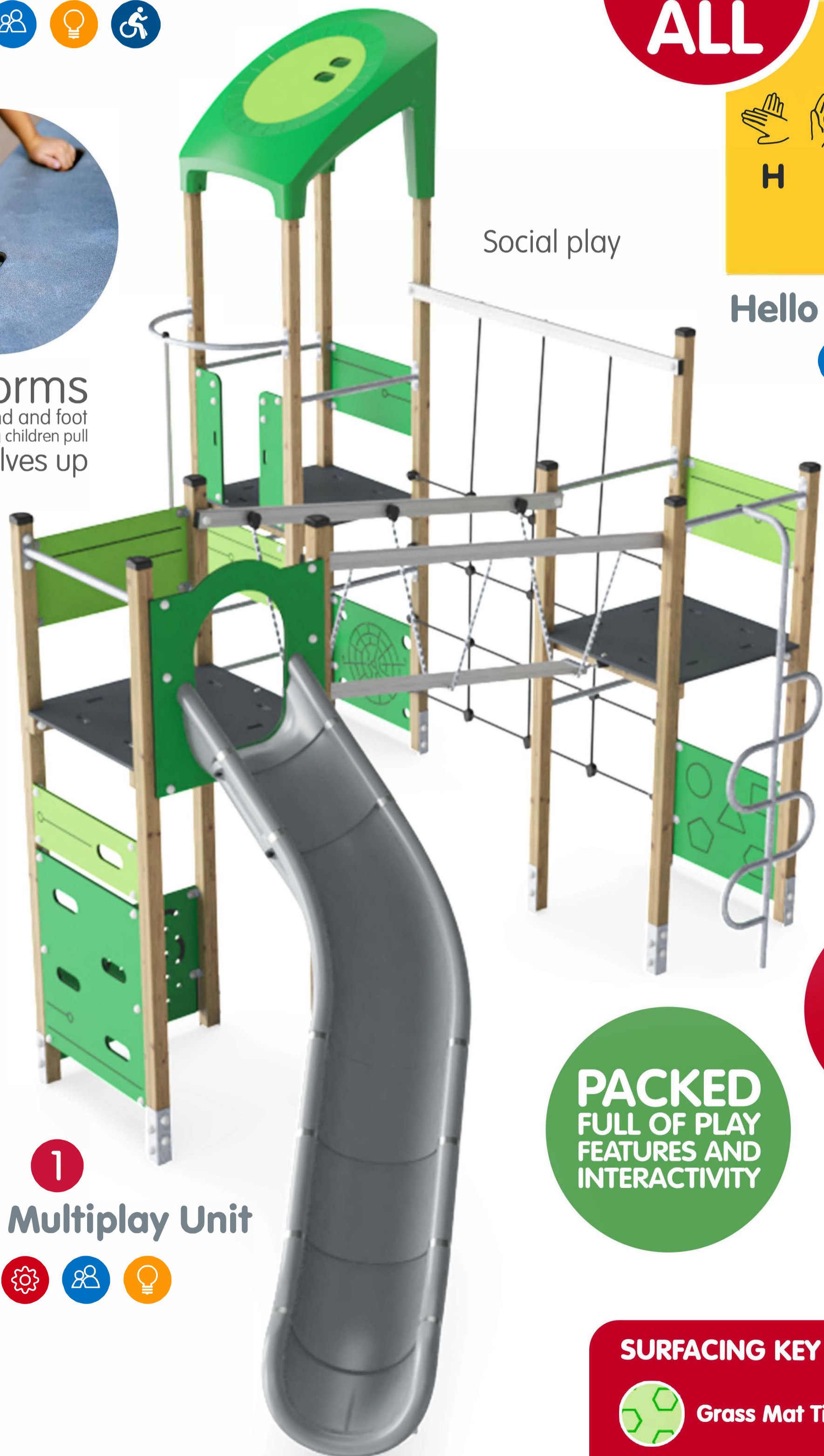
3 Tower Multiplay Unit

Platforms feature hand and foot holds, helping children pull themselves up