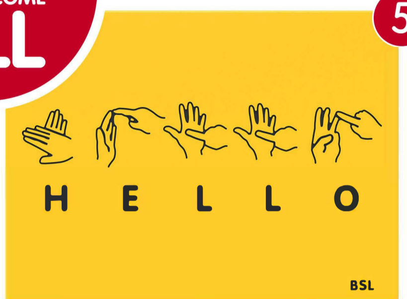
Hello Sign Language

POSITIONED AT THE ENTRANCE TO WELCOME ALL