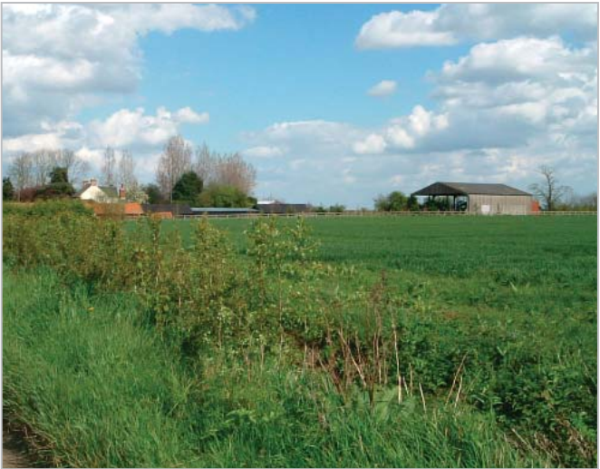
Plateau view to farm buildings