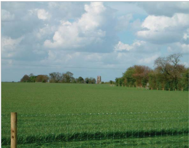
View across plateau to isolated church