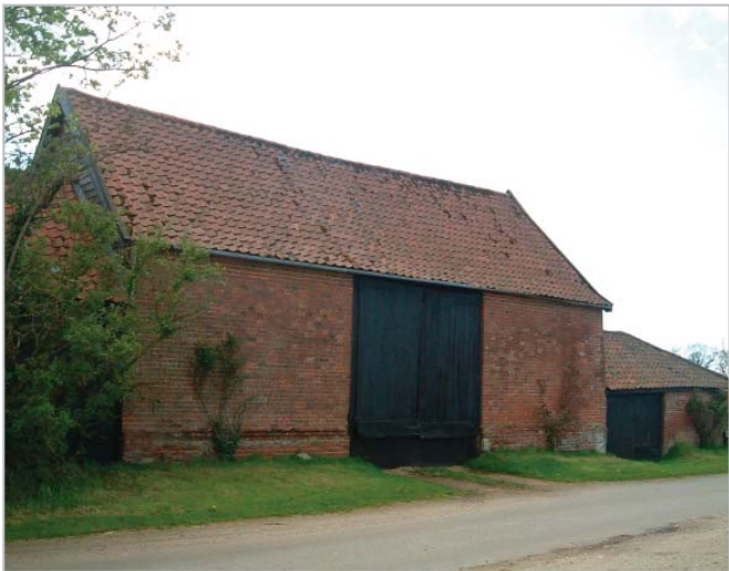
Red brick barns