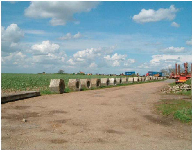
Deopham Stalland Airfield