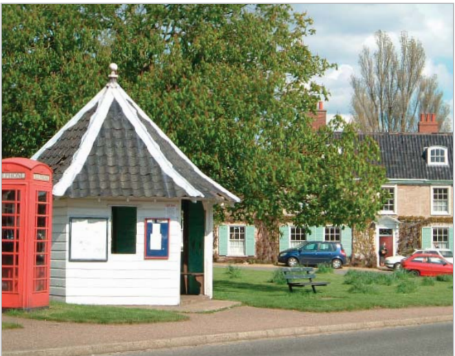
Village green at Hingham