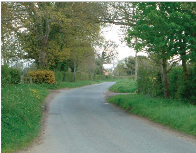
Roads are flanked by wide grass verges