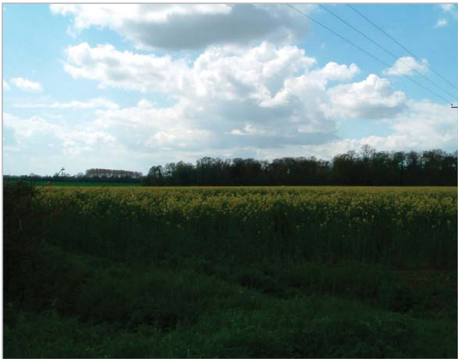
Woodland blocks provide enclosure