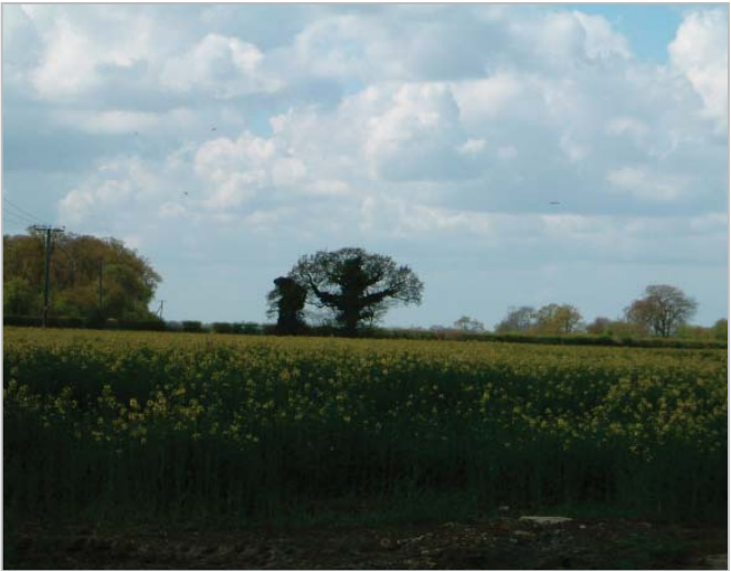
Mature remnant oak hedgerow trees occur within trimmed hawthorn hedges