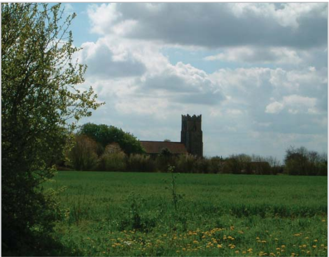
The church at Bunwell