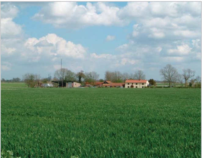
Large geometric arable fields