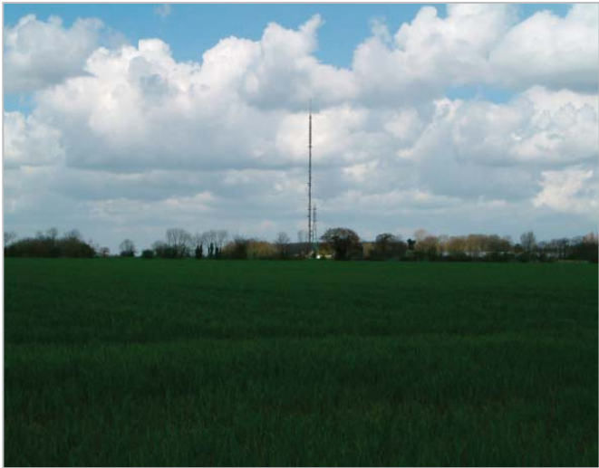
View to Talconeston transmitting station