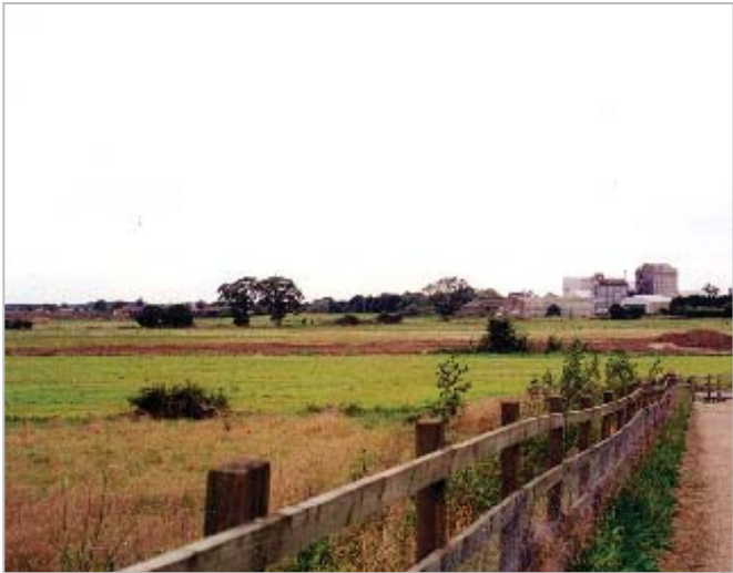
Plateau top view