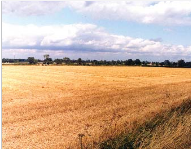
View of the plateau demonstrating the flatness and sense of openness, in part due to the removal of field boundaries