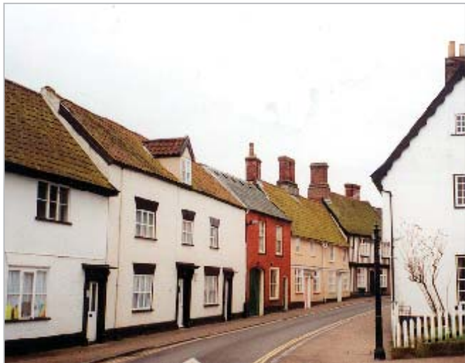
Typical Wymondham street with appealing timber-framed and brick vernacular architecture