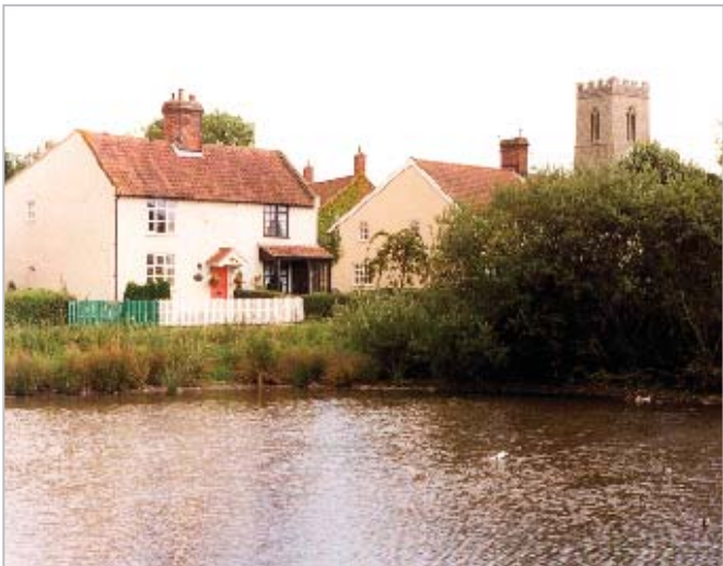
Mulbarton church and pond illustrating the character of the smaller settled villages on the plateau