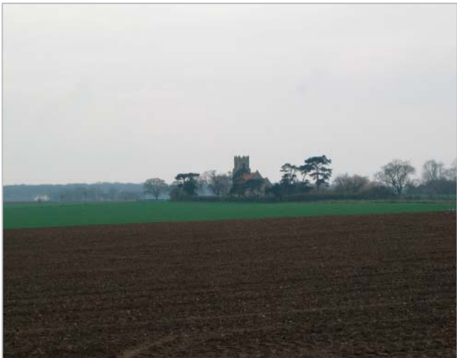
Isolated church north of Broome