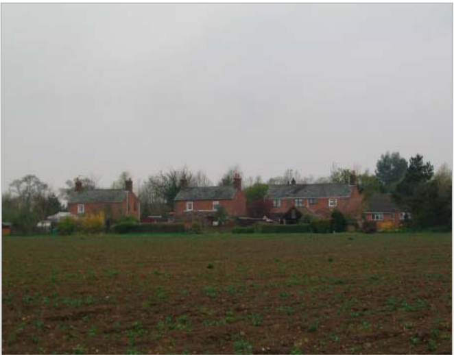
View across arable fields towards Tofts Monk