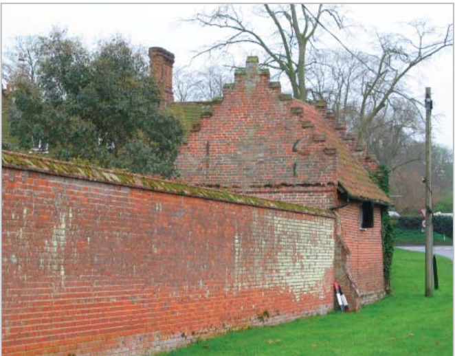
Crow stepped gable end