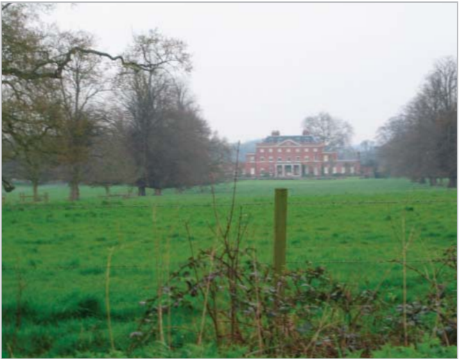
Parkland at Ravingham Hall