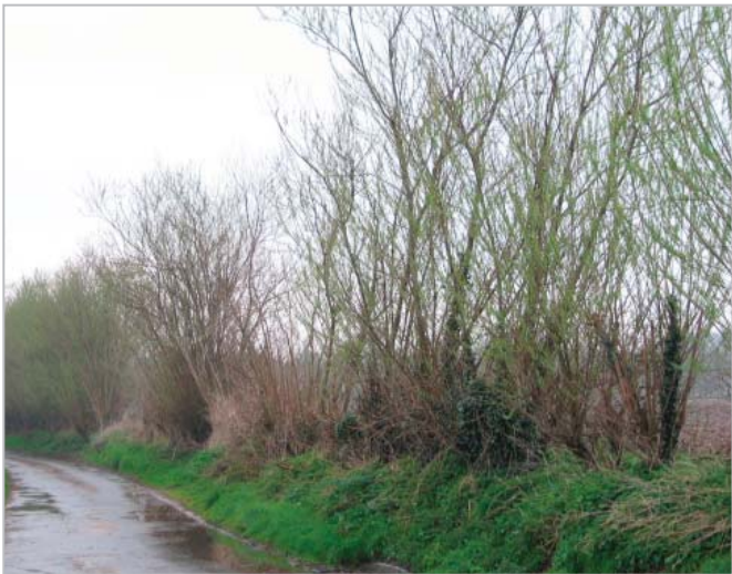
Willow occurs in hedgerows near Wheatacre