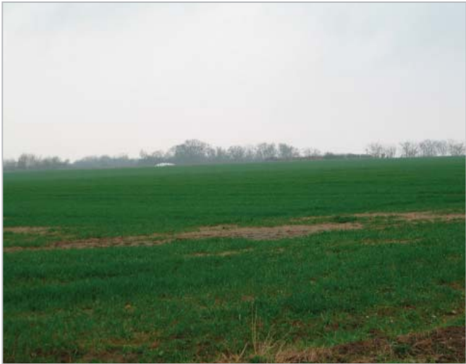
View across arable farmland to the skyline of the Broads