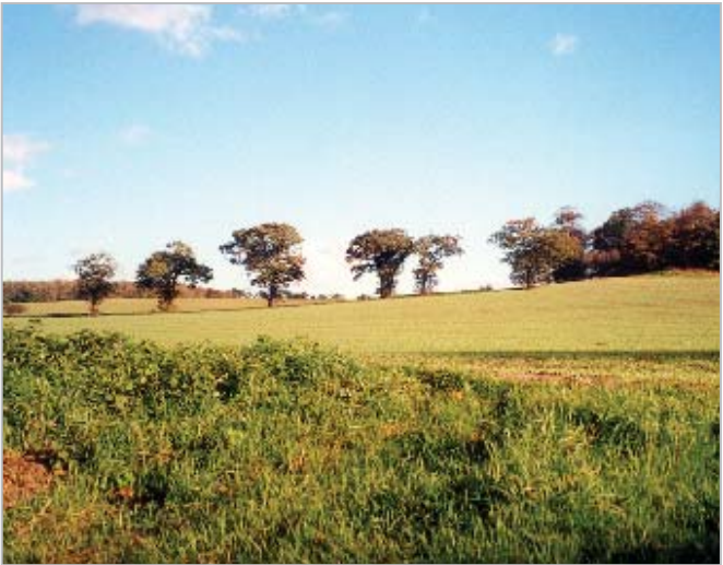
Characteristic sloping arable farmland with remnant oak hedge-row standards and a characteristic wooded horizon near Caistor St Edmund