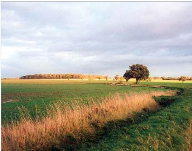
Typical open arable landscape near Hempnall