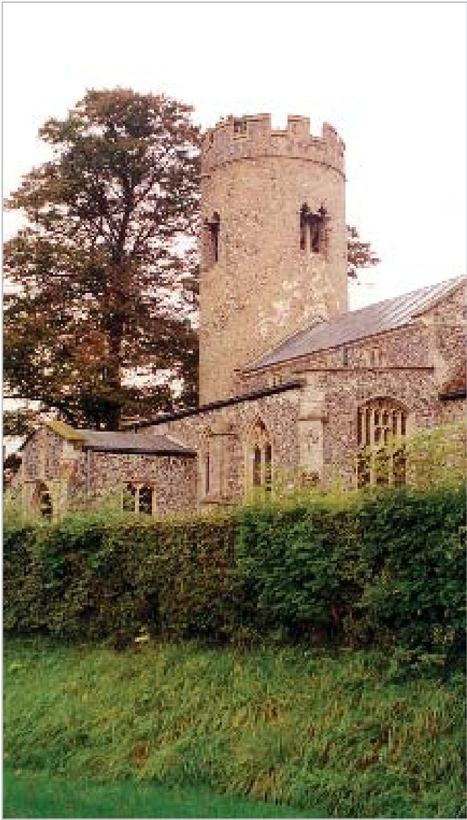
The area includes attractive isolated churches with the regionally-characteristic round-tower such as St. Michael's at Aslacton