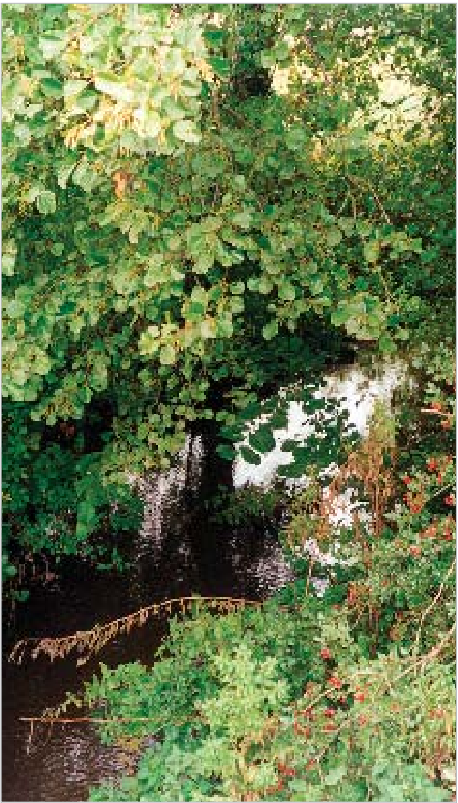
The small tributary streams are screened in the wider landscape by the presence of bankside vegetation as at this example near Bunwell Hill