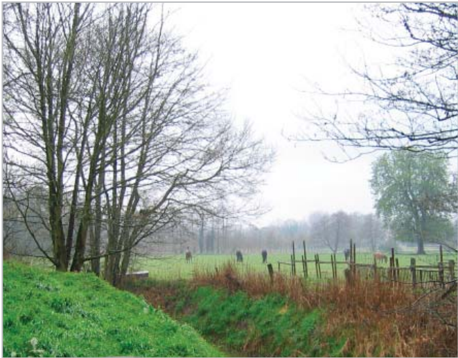
Grazed pasture within the valley