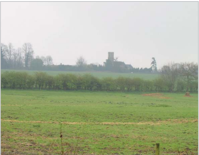
Churches provide distinctive landmarks (e.g. at Roydon)