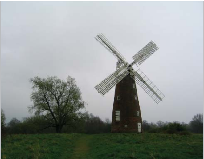
The windmill at Billingford