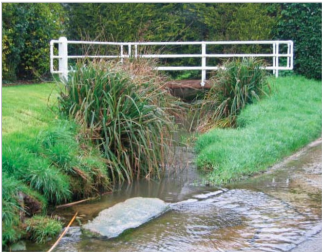
Bridge and Ford at Brockdish