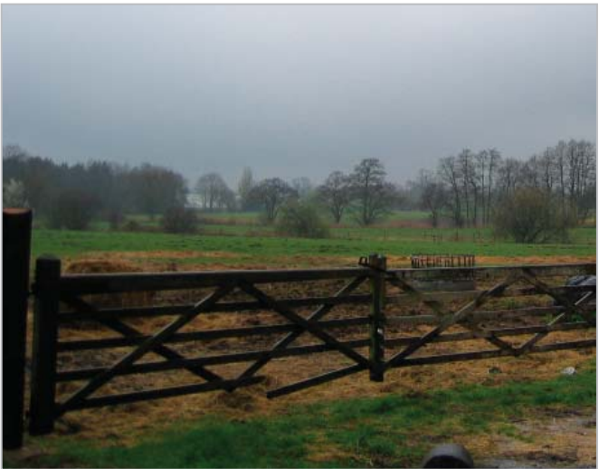
View across farmland