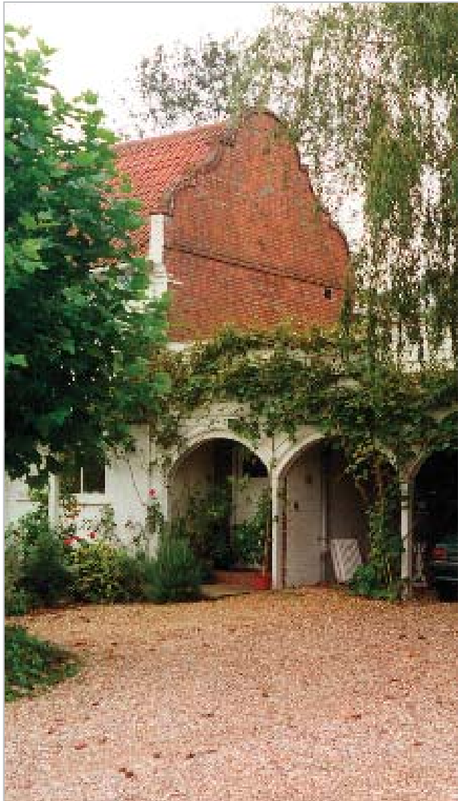
Buildings with shaped or 'Dutch' gable ends are a feature of the landscape