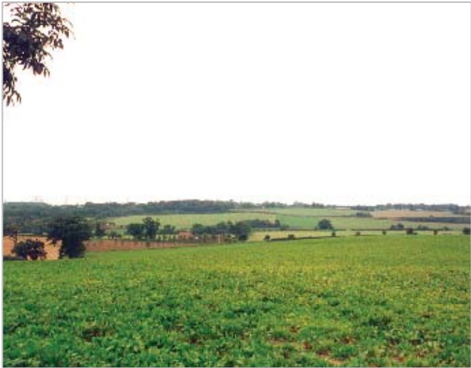
The strong valley form as in this view from Stoke Holy Cross