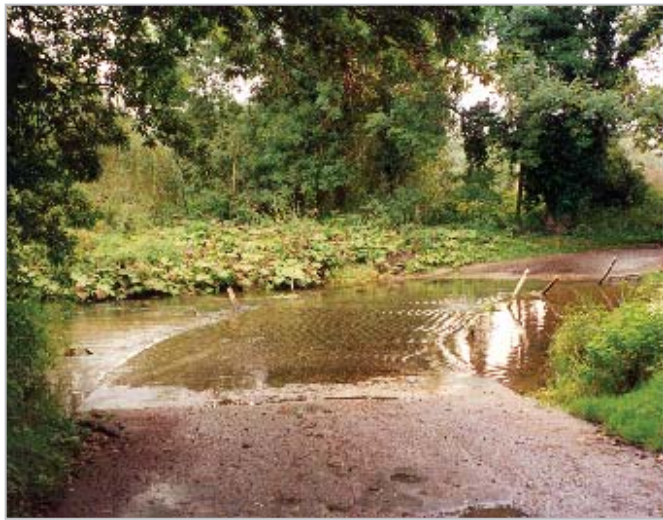
Forded river crossings, such as near Shotesham Park