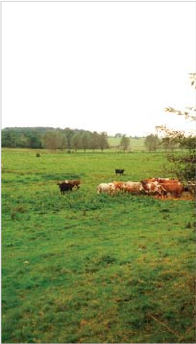
Grazed pasture on the valley floor